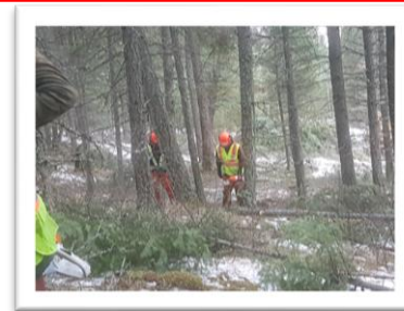
Forest Fuel Reduction Project- crews reducing ladder fuels.

SRG is managing the SFN Fire Fuel Reduction Project on behalf of the Chu Chua Fire Department to reduce the threat of wildfires to homes and structures in the community and currently. Work is focused on the Chinook Cove/Kenkekem Road area. This project started at the beginning of January and will be complete mid-February.